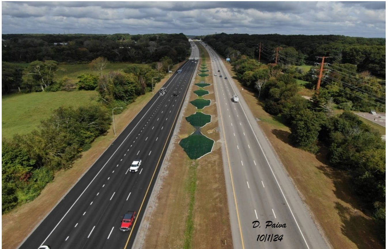
Route 4, East Greenwich RI